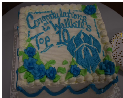
Cake Donated to the Top 10!