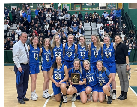
Varsity Girls Basketball Wins Section IX and MHAL Championship!