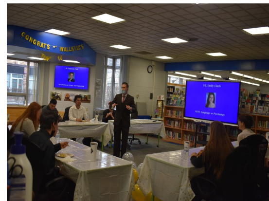
Top 10 Luncheon!