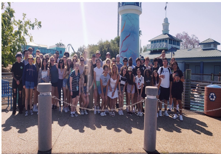
Group Shot of Panther Seniors on the Trip!

After a brief hiatus, the Senior Trip returned with a bang!