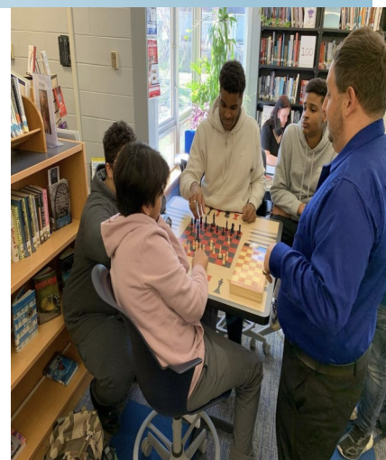
Competitive Chess Tournament in the Library!