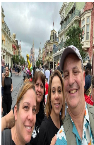
Chaperones at Magic Kingdom!